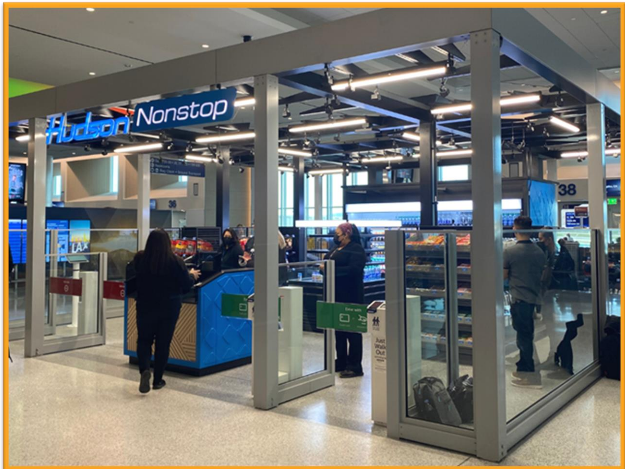
Hudson Nonstop is now open in the Terminal 3 Concourse