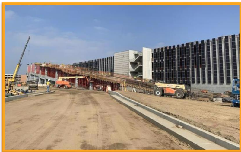
ConRAC Speed Ramps for Ready Return / Idle Storage Building