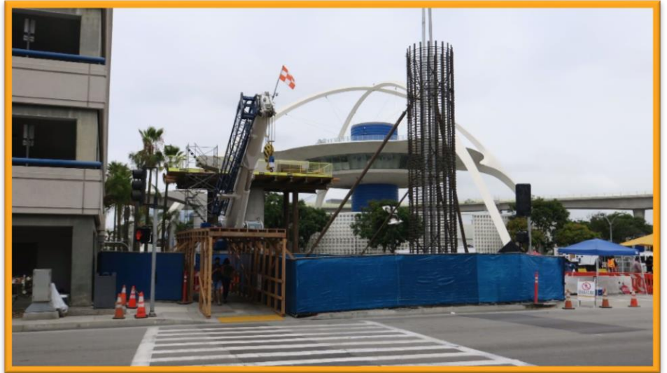
Pedestrian detours near Parking Structure 6