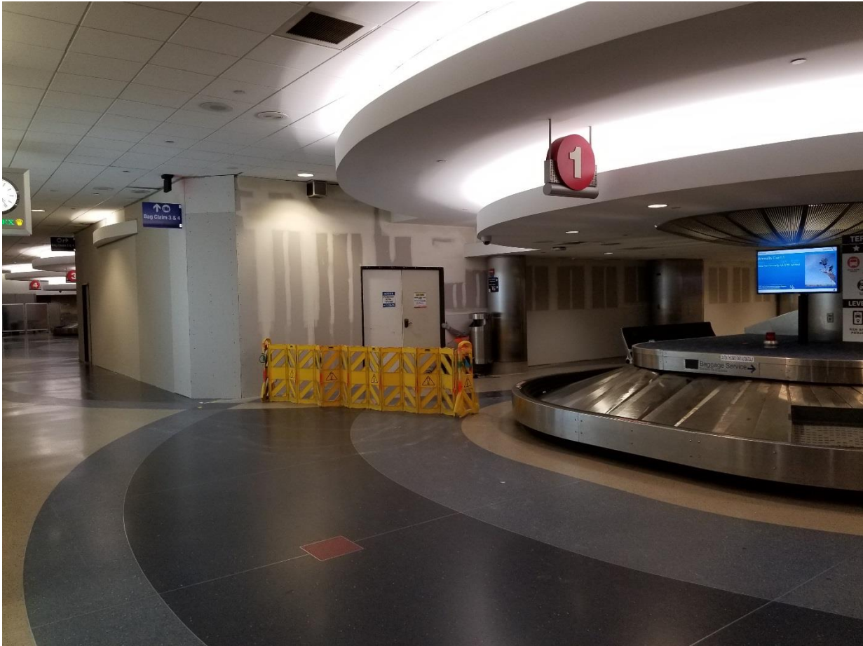
Terminal 4, Arrivals Level