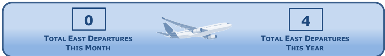
East Departures Yearly Comparison

The number of East Departures may vary from month to month due to weather, air traffic volume, and/or operational factors.