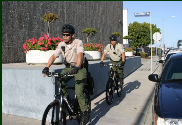
➤ Bike Patrol