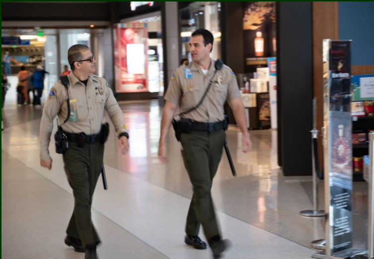
➤ Foot Patrol