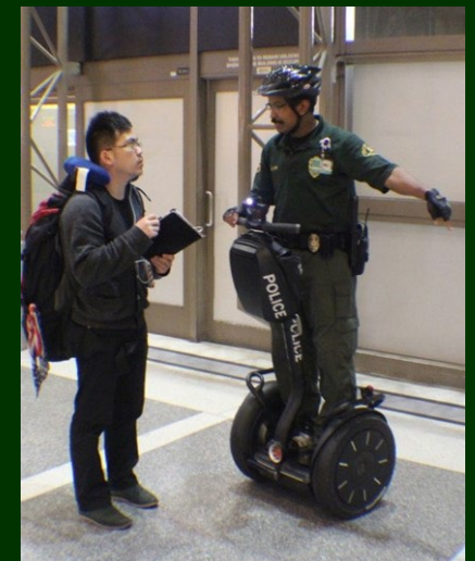
➤ Segway Patrol